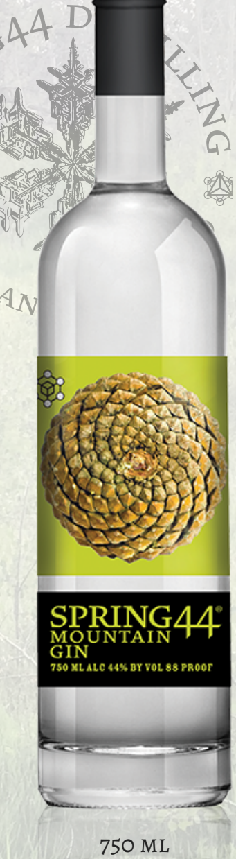
44% ABV 88 proof

Distilled from USA-grown, non-GMO corn. Gluten-free. Proudly made in Loveland, CO USA with Rocky Mountain artesian mineral spring water. Follow us at spring44.com